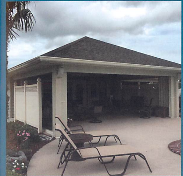
Almost invisible when opened