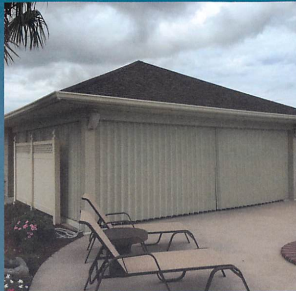
Large span porch closed for storage